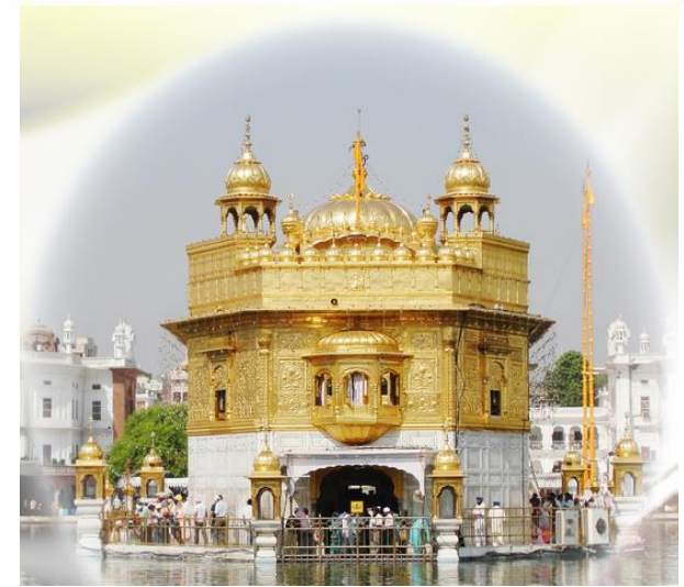
Sri Darbar Sahib (Golden Temple), Amritsar INDIA